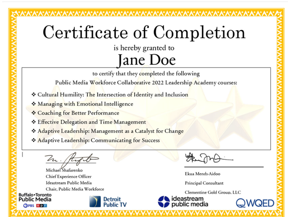
Image: Official Certification of Completion given to all PMWC Leadership Academy Participants.

Each station of the PMWC had their HR representatives meet with their Leadership Academy participants after sessions two, four, and six to receive feedback on the successes and failures of the program. These representatives, core group members, also met with CGG regularly during the six-month period of the training sessions to provide feedback to their consultants.