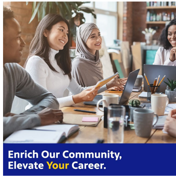
Theme: Cooperative Growth