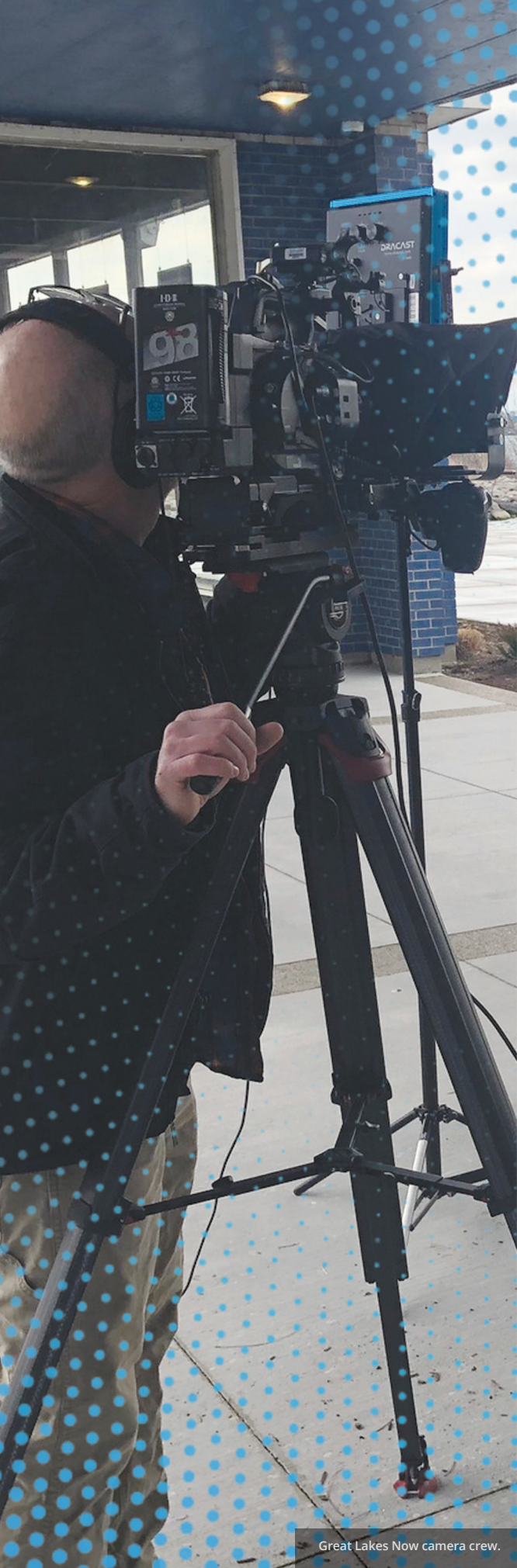
Great Lakes Now camera crew.