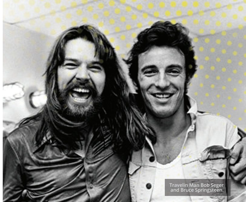
Travelin Man Bob Seger and Bruce Springsteen.