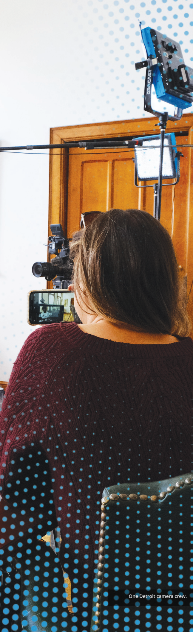
One Detroit camera crew.