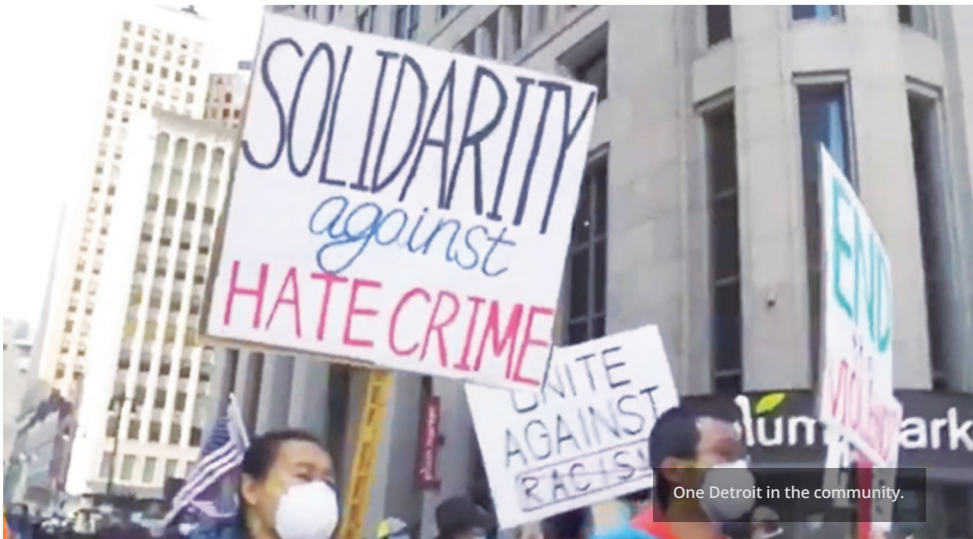
One Detroit in the community.