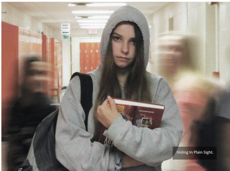
Hiding In Plain Sight.