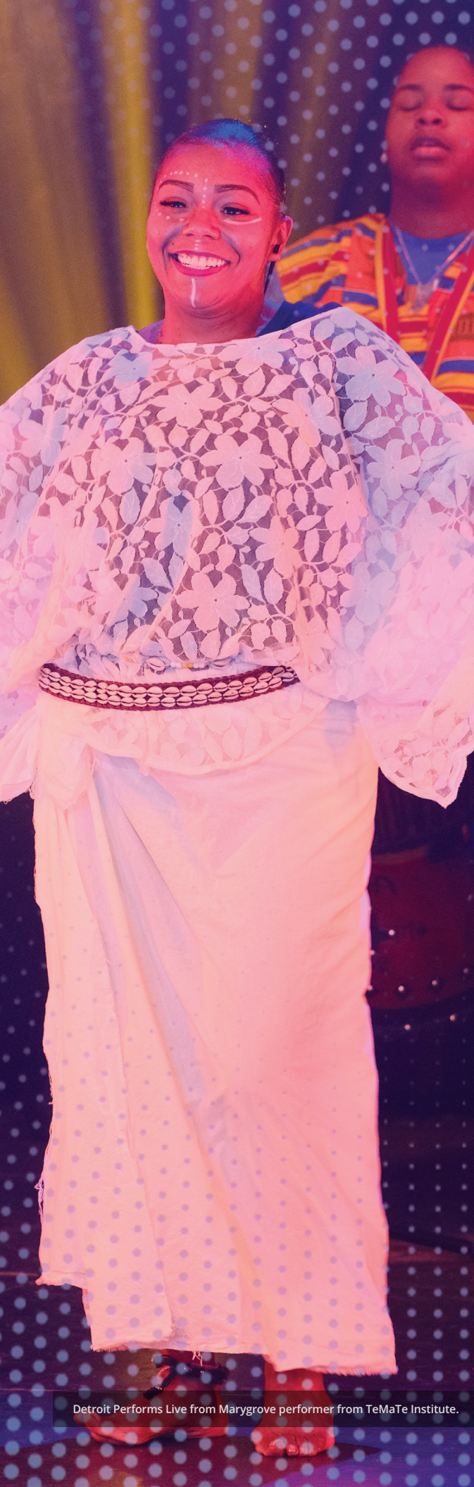
Detroit Performs Live from Marygrove performer from TeMaTe Institute.