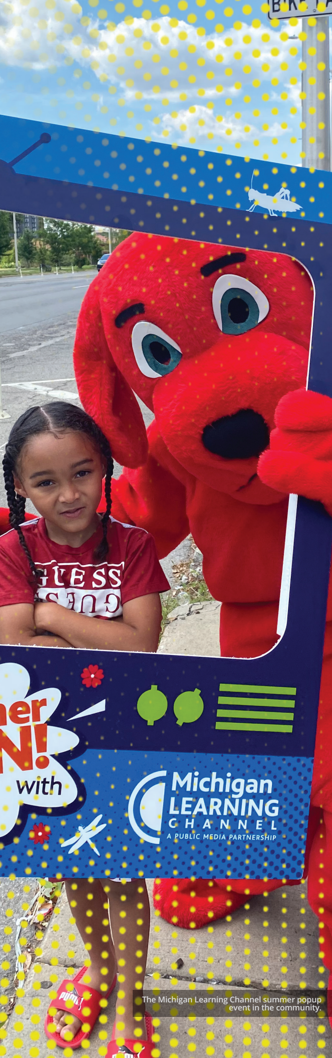
The Michigan Learning Channel summer popup event in the community.