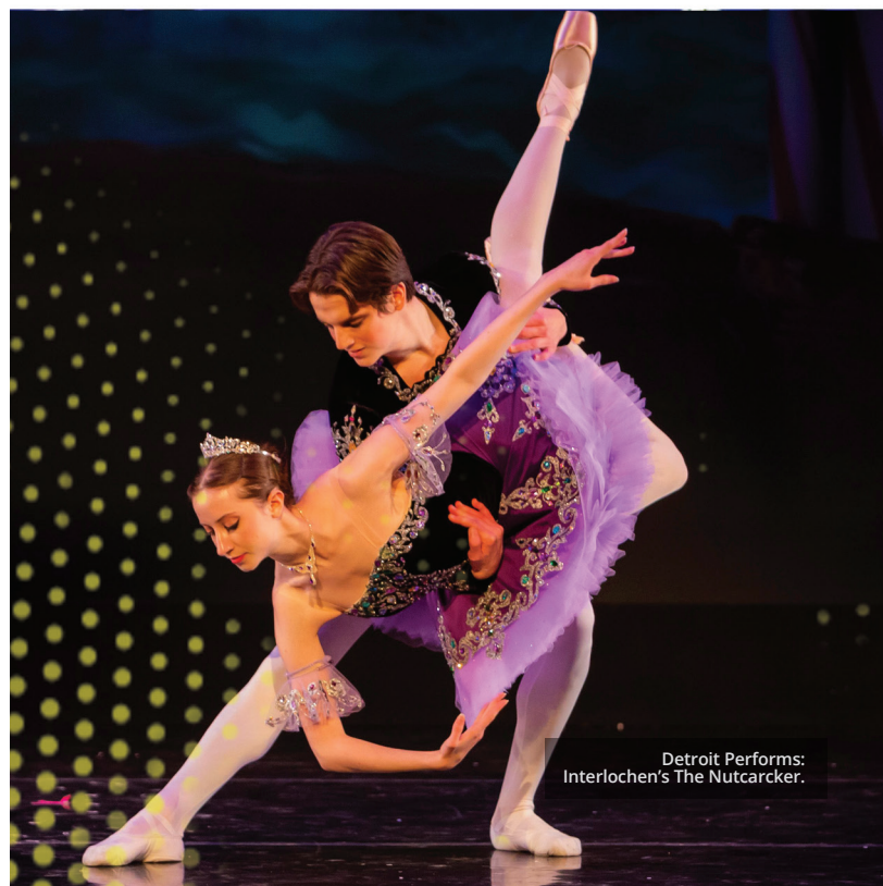
Detroit Performs: Interlochen's The Nutcracker.

In another collaboration with Interlochen, Detroit Performs presented Tchaikovsky's endearing holiday classic, which recants the whimsical story of Clara and the valiant Nutcracker prince who dance their way through the Land of Sweets. Beautifully choreographed, this artistic spectacle combined graceful dancing, dazzling costumes, magical set design, and live accompaniment by the Interlochen Arts Academy Orchestra.