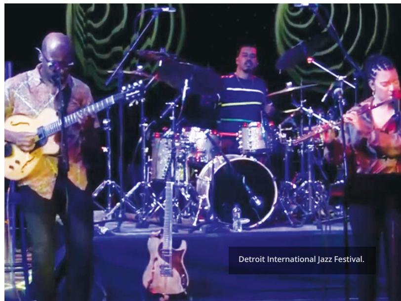
Detroit International Jazz Festival.

After a hiatus due to the COVID-19 pandemic, the world's largest free jazz festival, featuring world-class talent, returned to an in-person event. The annual festival features the artistry and improvisation of jazz legends, rising stars, legacy and homecoming artists. During 2022 more than 60 acts performed and Detroit Public TV and 90.9 WRCJ shared livestreams from the festival each day of the event. 90.9 WRCJ also offered nightly live radio broadcasts, which allowed even more listeners and viewers to enjoy the sounds of Herbie Hancock, Gregory Porter, Dee Dee Bridgewater and others.