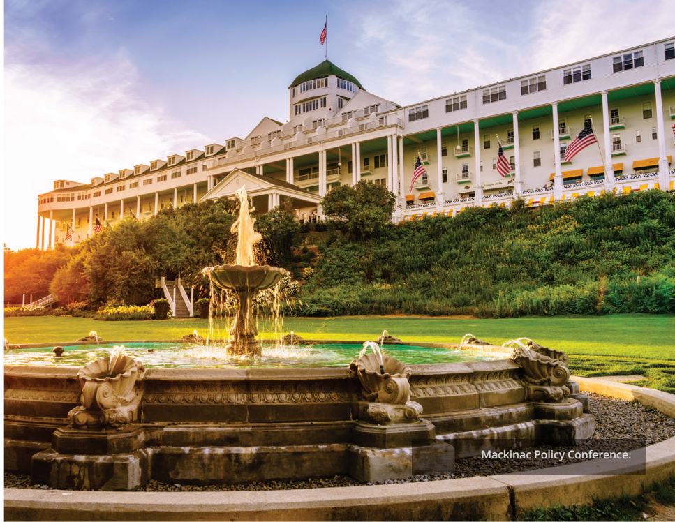
Mackinac Policy Conference.